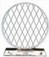
AL DAR SALES PERFORMANCE AWARD 1ST PLACE - 2018