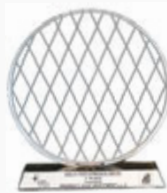
AL DAR TOP PERFORMER 2017