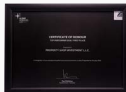
AL DAR TOP PERFORMING AGENCY 1ST PLACE - 2016