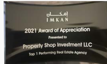
IMKAN TOP PERFORMING AGENCY 1ST PLACE - 2021